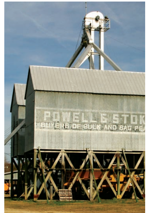
Powell & Stokes’s storehouses hold nuts waiting to be processed and packaged as Bertie County Peanuts.